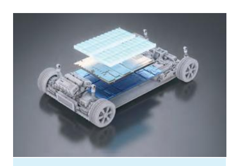
Battery Management System