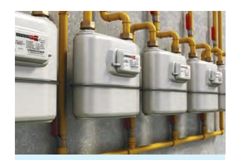
Gas Meter & Gas Distribution System