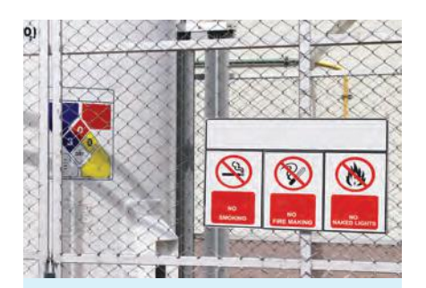
Electronic Devices Installed Within Explosive Environment