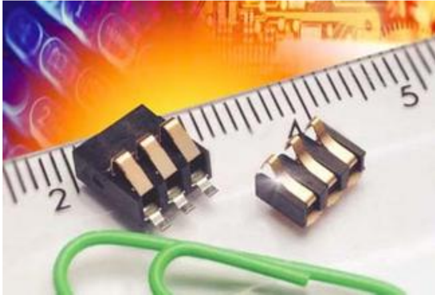
Figure 3. Demonstration of 50% savings in connector volume (right) as compared to existing commercial connectors (left).

Two recently released surface-mount technology (SMT) connectors address overall connector size and z-axis height. The first of these two products offers almost 50% savings in connector size—the actual volume of the connector—compared to existing commercial connectors (see Fig. 3). This significant reduction in size, however, does not diminish any of the key contact/connector performance requirements.