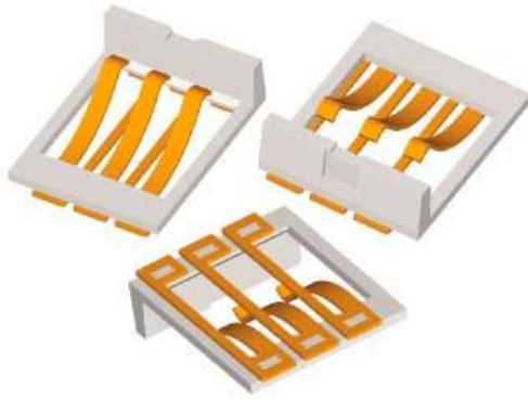
Figure 4. The simple design of ultralow-profile connectors can reduce z-axis height by 50%, or as low as 2.0 mm.

The first connector to be released in the new ultralow-profile family starts with a contact beam static height of 2.45 mm. Once fully deflected, the compressed height reduces to 1.3 mm above the board, or about a 50% reduction in z-axis height from the battery connectors discussed previously. Remarkably, even at this profile, the primary and secondary performance features of the connector have not been sacrificed. This is still a 3-A contact system providing high durability and high-tolerance absorption features that are derived from proven beryllium-copper base material and a stable contact beam design. The long sweeping design of this contact provides positive mechanical solder attachment to the PCB with a full-length tail that extends from both ends of the insulator. The high-temperature insulator has an integral end stop to aid in either radial (angular) or slide-in (horizontal) battery engagement.