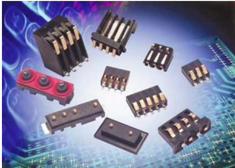
Figure 1. Battery pack connectors come in various sizes and shapes featuring two distinct contact configurations: stamped cantilever contacts for consumer electronic products, and spring-loaded "pogo pins" for industrial

Of primary concern to most design engineers is durability. The contact geometry must provide stub-free operation for a specified number of cycles. The average connector is rated at a minimum of 5,000 insertion and withdrawal cycles. In addition to the contact shape, the finished plating on the contact and adjacent pad is a major contributor to the life cycle of the device. Gold plating has become the defacto standard for its durability and lower contact resistance properties, both of which maximize the length of charge.