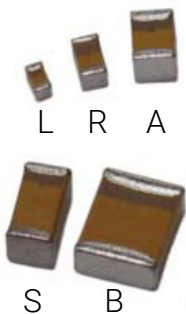
TBC Series Case Sizes

TAZ FAMILY SIZES: CWR09, CWR19, CWR29 and TCP Modules The TAZ family boasts the widest range of case sizes and fullest range of MIL-QPL qualifications of any tantalum chip family, making it the ideal choice for the MIL-Aerospace designer. This family represents the most flexible of surface mount form factors. The case sizes originate from the original MIL chip sizes, enabling support for all legacy programs, but have been extended to include both smaller and larger case size options. There are ten case sizes covering the full Capacitance/Voltage range. Parts are suited to hybrid or PCB assembly, with case sizes A to E designed as low profile (.050" nom). The Low ESR versions of the larger case sizes are ideally suited to power applications, and the H case is also footprint compatible with TBJ D / E case sizes. This family is also the ideal replacement for conformal coated CWR06 styles in mechanically demanding applications.