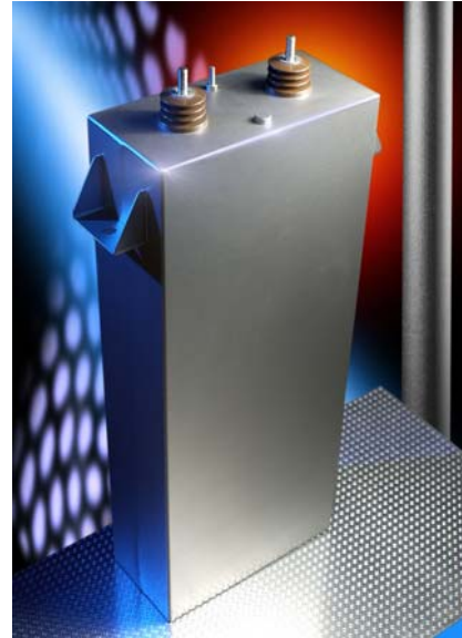
Figure 2: Trafim

and are specified at 3mF, 1890Vdc (DKTFM546); 2.5 mF, 2630 Vdc (DKTFM603); 1.67 mF, 4000 Vdc (DKTFM537); and 1mF, 4000Vdc (DKTFM538).